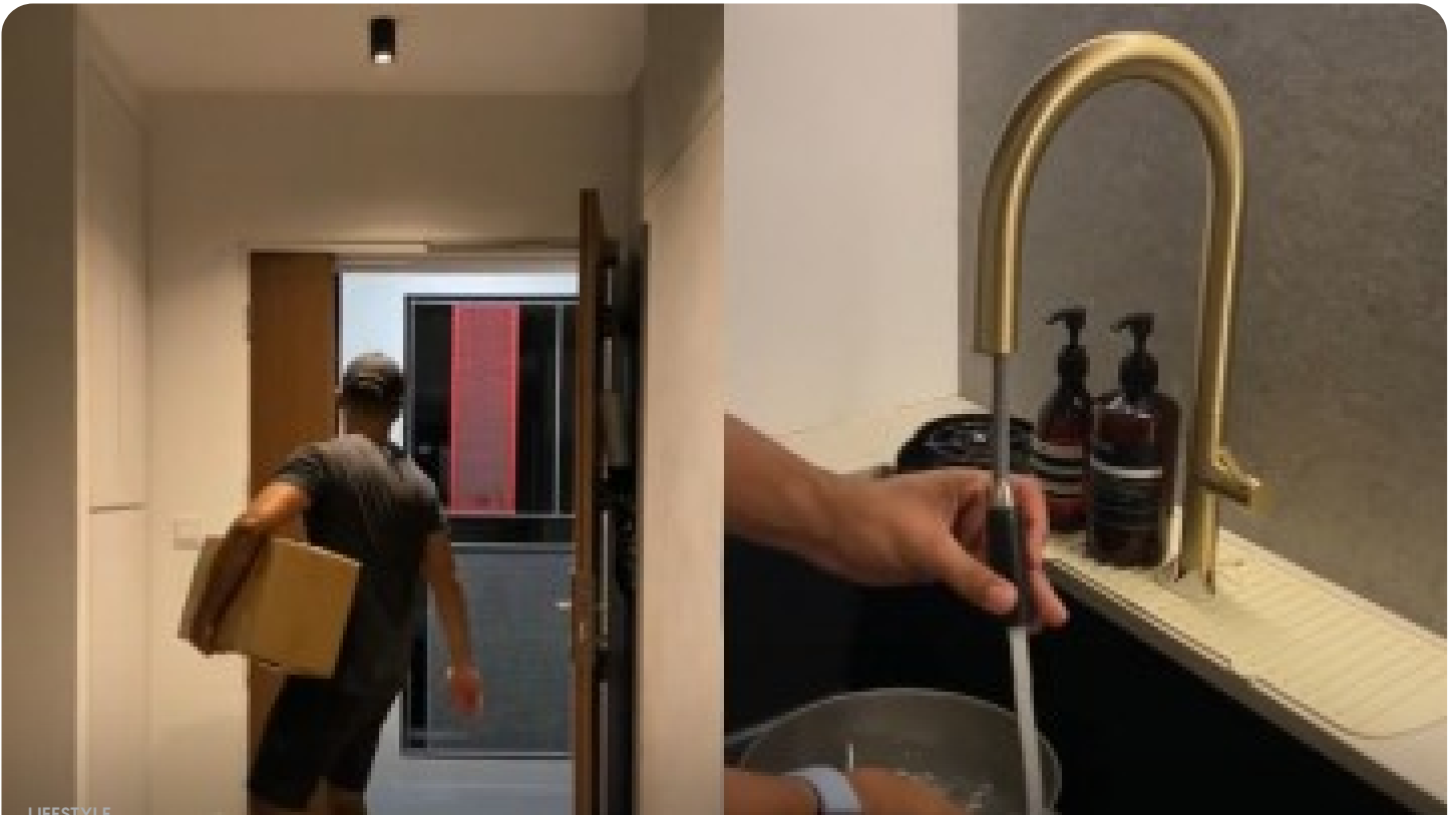
'So fun to have yet convenient': Couple pick out 5 design features they love about their newly renovated home