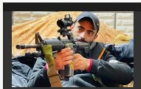
Palestinian gunman killed by Israeli forces

'Put a shirt on,' Tel Aviv bus driver tells female passenger wearing tank top