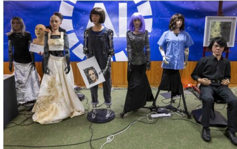
Robots are presented during a press conference with a panel of AI-enabled humanoid social robots as part of International Telecommunications Union (ITU) AI for Good' global summit in Geneva, Switzerland, Friday, July 07, 2023.

GENEVA, Switzerland (AFP) — A panel of AI-enabled humanoid robots told a United Nations summit on Friday that they could eventually run the world better than humans.